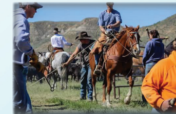
HEAD OR HEEL - 05 AQHA Sorrel Geld x Mao Moon Creek Boy x Ducles Peppy; Rodeos runs, heeling at the corner all day. Get your dally quick. Drags calves to fire, won't pack elk! Can turn into calf roping or breakaway. Spin on a dime, too. FMI 406.674.7046