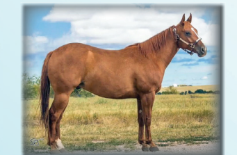
SWITCH END ROPE HORSE - 2011 AQHA Sorrel Geld x Vibrant San Bar; Hunt on, lead a pack string, excellent ranch horse, hauled to ropings all winter. Do-it-all kind of horse. Outstanding switch-end rope or breakaway horse. FMI 307.660.4149