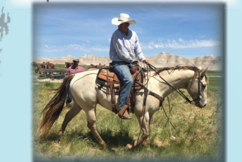
RANCH OR ROPE - 2011 AQHA Buckskin Geld x Niobrara Rocket; Super stout, good looking, outstanding ranch horse, quickly becoming a solid head horse, scores great, runs really solid and flat. Keeps getting better, started on breakaway and tie down, too.