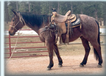
HEAD, HEEL, or BREAKAWAY - 2008 AQHA Bay Roan Geld x Boonsmal Cee Lena x Pepto, dam is dtr of Justa Swinging Peppy; Hauled, won on, scores great, can win at any level. Come watch him in the jackpot. FMI 605.380.7533.