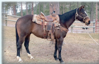
READY TO HAUL - 09 AQHA Brown Geld x Don't Haida The Cash x Miss N Cash; Finished breakaway and heel horse. Ready to haul, been used to brand and used for all the ranch chores. Good bone and foot, too. FMI 605.380.7533.