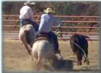
SOLID HEEL HORSE - 2010 Red Roan Gelding X Peptosmart. Pretty with lots of ability. Started as a cutter and since has been outside doctoring cattle. Hauled to jackpots, nothing bothers him, he's good minded, I can't say enough good about this gelding. He has all the pieces and parts and is a showstopper. FMI 580.301.3724