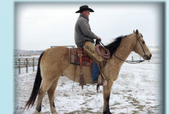
GENTLE & BUCKSKIN - 05 AQHA Buckskin Geld x Gees Speedy Freckle; Stands 16h, gentle with a big motor; See it all on the ranch from big country to the branding pen. Also been headed on, really nice gentle horse that can go all day. FMI 406.347.5243