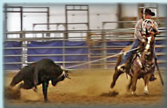
HEAD AND HEEL - 09 AQHA Sorrel Geld x Wild Haired Cat; Outstanding switch-end team roping horse. Finished on both ends, hauled extensively, very broke, will watch a cow, quick feet, lots of run, plenty of rate. Correct Conformation, chrome, easy mover. Kind and respectful. FMI 605.484.7117.