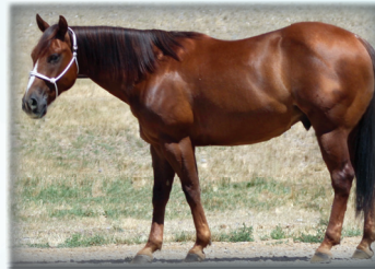
BIGTIME HEAD HORSE! 2011 AQHA Sorrel Gelding x Cat Dot Com x HBC; Flawlessly made, lots of feel and talent in arena and ranch. If you are looking for THE one to step up your heading game, a 5 and above will appreciate him. Has the feel and foot speed, handles right with a snappy face. FMI 406.381.2347