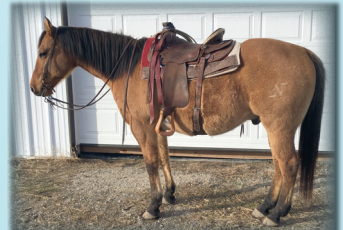
HAULED & WON ON - TE WILTYWIST - 02 AQHA Dun Geld x Wilywood x Orphan Drift and out of a dtr of Nebraska Boy; Head horse deluxe, quiet, run rate, nice move. Gentle! Great jackpot and rodeo horse, used a lot on the ranch, too. FMI 406.592.4113