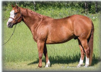
SAFE, GENTLE, COWY - Smart Whittle Pepto - 2006 AQHA Sorrel Gelding x Smart Whittle Play and out of dtr of Pepto. Fun to ride, quick on his feet, known as the "Cadillac" for his smooth ride. All aspects of ranch work. FMI 406.395.4840.