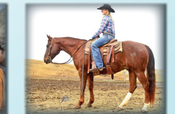
ABSOLUTE GENTLEMAN - 08 AQHA Chestnut Geld x Highlightcat x HBC; Finished head and breakaway horse, been hauled, won on in both events. Lots of run and rate, flawlessly handles cattle, faces. Ranch ridden, he's flashy, soft in the face and ribs and travels level. FMI 406.262.3684