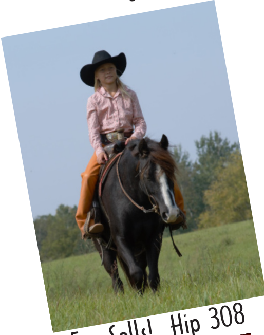
Fez Sells! Hip 308

First Class Mail U.S. Postage Paid Billings, Montana Permit No. 1