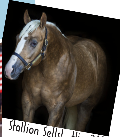
Stallion Sells! Hip 263