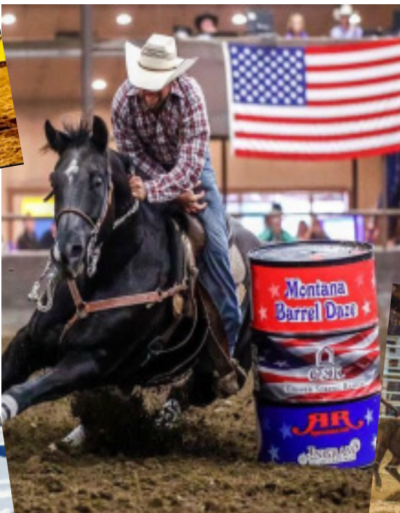
Jackpots & Rodeo! Hip 250