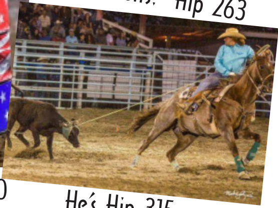
He's Hip 315