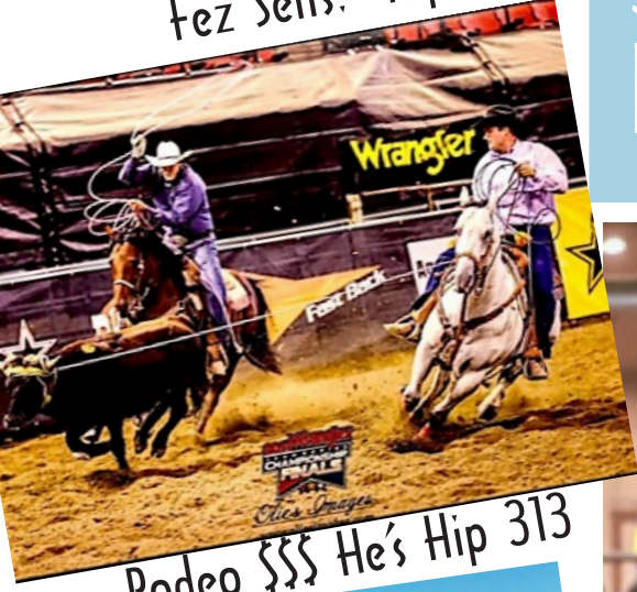
Rodeo $$$ He's Hip 313