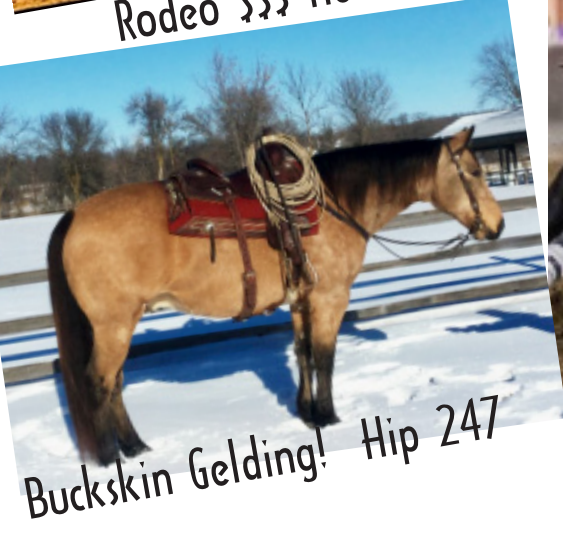
Buckskin Gelding! Hip 247