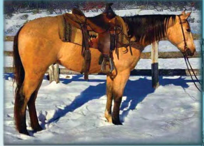
TNT CISCO FROST

13 AQHA Buckskin Geld x PC Cisco Frost x Sunfrost; Super gentle, started and trained here at the ranch, good minded and willing. Always been gentle, and is coming along nicely in his training. Cisco has good lope departures, takes both leads, is soft in his face and sides and is starting to turn around nicely. FMI / Video 507-951-7880