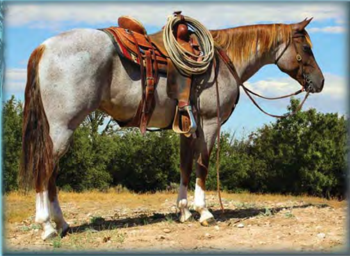
SF TWO TIMING QUIXOTE

INDOOR PERFORMANCE PREVIEW FRIDAY! 10 AM